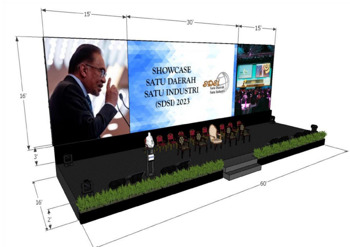
View of Main Stage

(to include visuals of pavilions, booths & view of Majlis Perasmian)