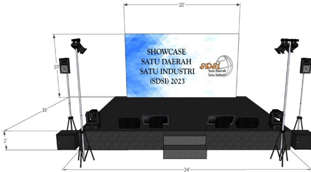
View of Mini Stage (to include visuals of booths & tables and chairs)